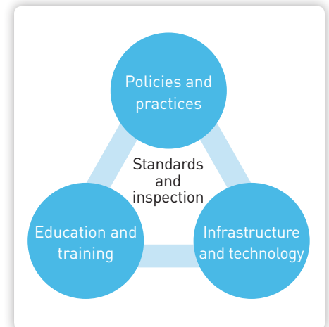
FIGURE 1: BECTA PIES MODEL

In the Common Inspection Framework for further education and skills 2009, safeguarding is one of the limiting grades and is considered to be essential in assuring the safe development and well-being of young people and adults. The grade for safeguarding may therefore limit other inspection grades, including the grades for leadership and management and overall effectiveness.