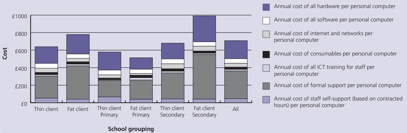
Breakdown of TCO per Terminal or Personal Computer

However, the Thin Client primary schools studied spent a lower proportion of their budget on support than the Fat Client primary schools studied. This may be because they outsource their support, and are therefore able to secure what they need at a lower price than if they were to provide it internally. This factor was marginal for secondary schools.