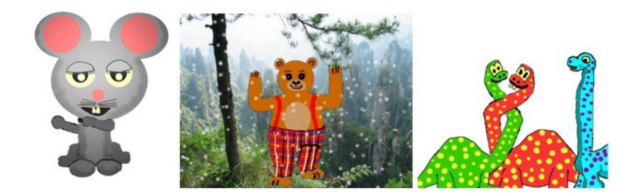
There, the songs can be viewed on video, to ascertain whether the song is suitable or not, and the vocal track, backing track, lyrics and sheet music can then all be downloaded free at TES.